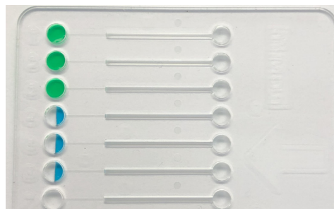
Figure 1: Honeybun (A) is the only rapid microvolume viscometer and rheometer for proteins, vaccines, viral vectors and injectables. Honeybun and its consumable Bun (B) read up to ten samples in minutes with just 35 \mu L (Channels 1–3) or 15 \mu L (Channels 4–6) of sample.

concentration, hydrodynamic diameter, and polydispersity were verified using Stunner.