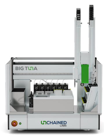
Figure 1: Big Tuna automates buffer exchange for up to 96 unique samples with Unfilter 96 or up to 24 unique samples with Unfilter 24.

Big Tuna was developed to automate the buffer exchange process, enable increased throughput, and provide degrees of process control that are otherwise inaccessible by manual methods (Figure 1). Big Tuna uses a pressure-based ultrafiltration/diafiltration (UF/DF) method to remove buffer.