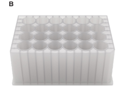
Figure 2: Big Tuna can accommodate both Unfilter 96 and Unfilter 24. (A) Unfilter 96 allows for up to 96 samples to be buffer exchanged simultaneously at volumes of 100-450 \mu L per well. (B) Unfilter 24 allows for up to 24 samples to be buffer exchanged simultaneously at volumes of 0.45-8 \mu L per well.