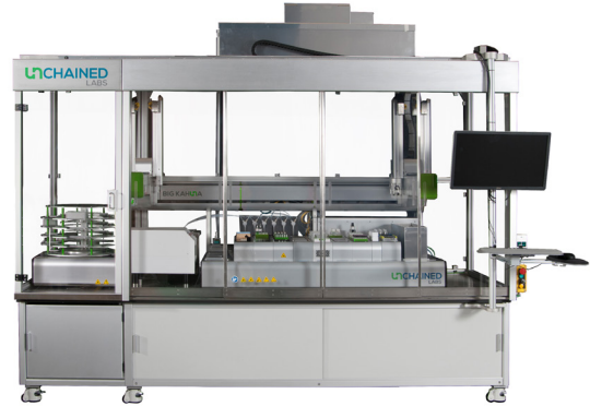
Figure 1: Big Kahuna with buffer exchange automates buffer exchange for up to 96 unique samples with the Unfilter 96.

Conventional exchange methods are labor intensive, prone to inconsistency, and difficult to manage in larger numbers. Automated buffer exchange systems can provide a more uniform sample handling approach and degrees of process control that are otherwise inaccessible by manual methods. Automating a platform buffer screen can further cut down the time required to optimize buffer conditions for new biologic molecules. Big Kahuna with buffer exchange auto-