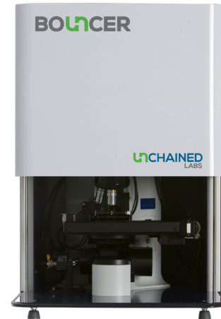
Bouncer measures silicone thickness, distribution and mass.