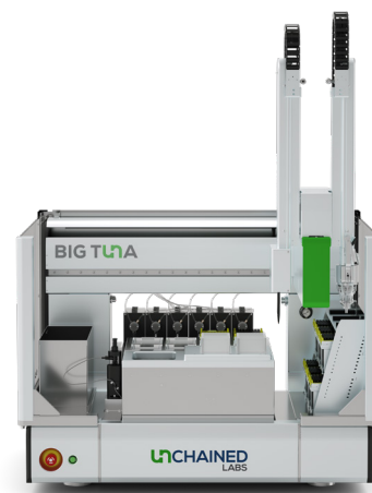
Figure 1: Big Tuna automates buffer exchange for up to 96 unique samples with Unfilter 96 or up to 24 unique samples with Unfilter 24.

Big Tuna was developed to automate the buffer exchange process, enable increased throughput, and provide degrees of process control that are otherwise inaccessible by manual methods (Figure 1). Big Tuna uses a pressure-based ultrafiltration/diafiltration (UF/DF) method to remove buffer.