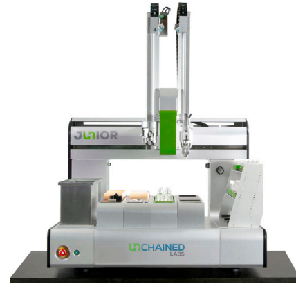
Junior configured for biologics formulation