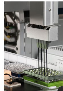
Multi-channel pH probes