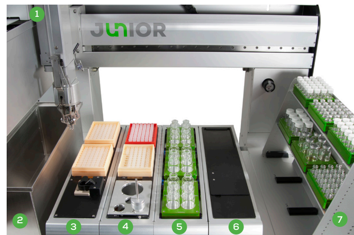
Example Junior deck configured for biologics formulation