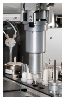
SV dispensers use vibration for precise delivery