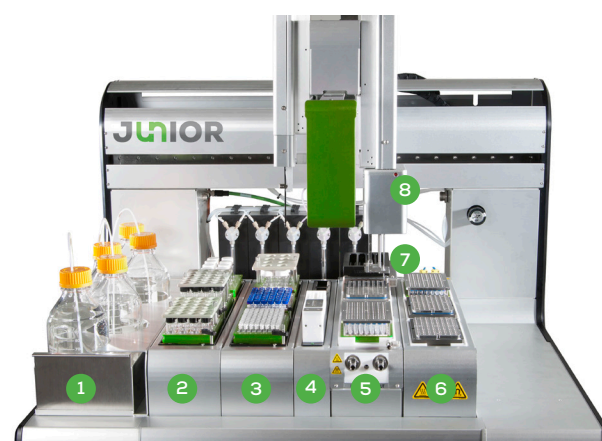
Example Junior deck configured for small molecule preformulation