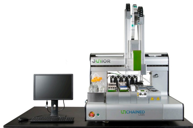
Junior configured for small molecule preformulation