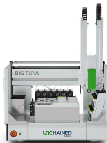
Figure 1: Big Tuna automates buffer exchange.

Buffer exchange with Big Tuna is highly customizable and adaptable, allowing for buffer exchange of up to 96 unique proteins and formulations in a single experiment. Unchained Labs developed two filter plate formats for this process. The Unfilter 96 and Unfilter 24 are filtration plates designed to withstand 60 psi pressurization during the buffer exchange process (Figure 2). Unfilter 96 can process up to 96